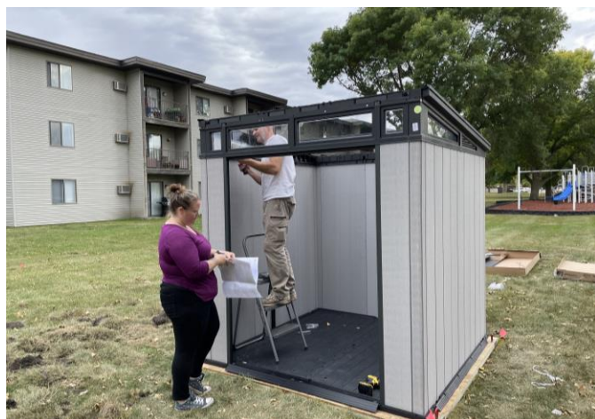
Southwest Minnesota Housing Partnership | Slayton, MN