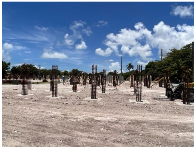
Florida Rural Neighborhoods begins construction on a new project. | Florida Keys, FL