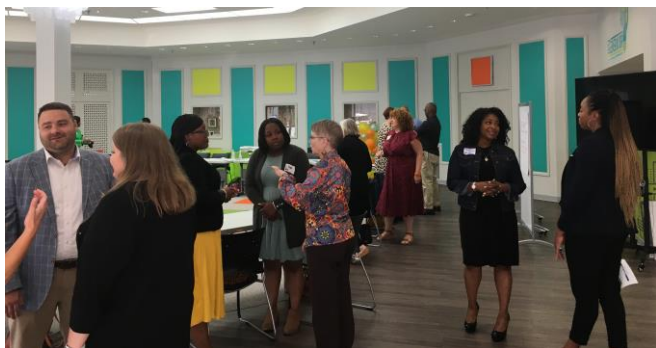
Stakeholders in the Delta region meet to discuss economic strategies. | Pine Bluff, AR

The most important aspect of the Rural LISC program is the technical assistance and training we provide for our Partner CDCs. We have convened 30 national training seminars for Partner CDCs, while also offering six Asset Management trainings for Partner and other rural CDCs. In addition, 24 regional workshops have been held that have assisted nearly 1,850 participants from rural CDCs, private funders, lenders, and government. We have also arranged 28 regional Home Loan Partnership trainings on affordable home ownership for rural CDCs and USDA officials, with an average attendance of 100 participants at each training.