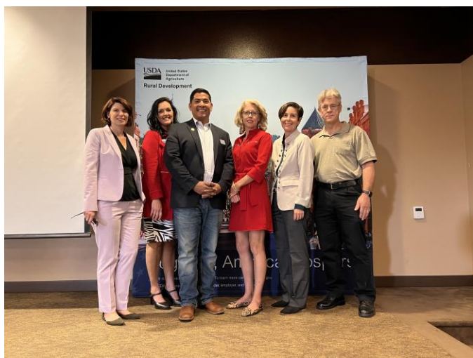
Rural LISC launches Rural Connect with $80k Grant from Wells Fargo | Twin Falls, ID

Established in April 1995, Rural LISC currently serves 146 partner organizations working to transform rural communities in 49 states and Puerto Rico.