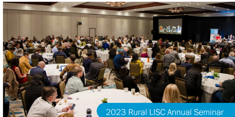
2023 Rural LISC Annual Seminar

In 2023 alone, more than 9,500 hours of technical assistance and training were provided to our partners in rural communities. In addition to deploying our subject matter experts in the field and facilitating peer connections, webinars are offered monthly and the Rural LISC Seminar is hosted annually, bringing more than 350 rural leaders from across the country to learn about innovations in the field.